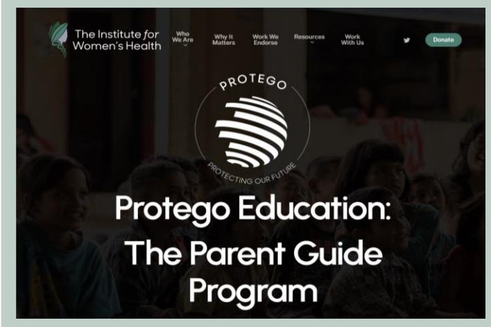
At time of writing, IWH's Protego website had limited details.