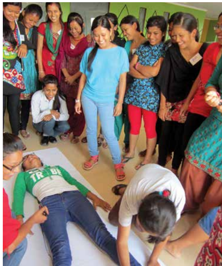
above: Youth facilitator leads body mapping activity

Ipas and its partners engaged the managers of participating factories to ensure their continued support of and in-kind contribution to our project. For a factory to participate in the project, the manager first had to agree to provide a convenient indoor space for the classes and guarantee that all women who wanted to attend would be allowed to without negative impacts on work or pay. Ipas and Bhaktapur Youth Information Forum then organized half-day orientation workshops for 32 managers that introduced them to SRHR issues and informed them of the project's purpose and the ways SRHR classes would benefit the women workers in their factories. After the orientation, many managers were enthusiastic about the project and encouraged their colleagues at other factories to also sign up.