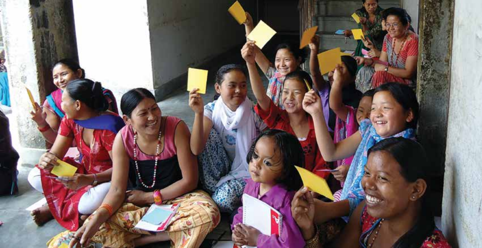
above: Women workers vote on actions to address unhealthy relationships

From 2011-2012, Ipas and our partners implemented a series of classes on sexual and reproductive health and rights (SRHR)—including information on safe abortion—for women who work at factories across Nepal’s Kathmandu Valley. Our project increased women workers’ knowledge of SRHR topics so they can better manage their own health and relationships and serve as resources for their families and communities. By partnering with local, youth-led organizations, we empowered young people to tailor the project to best meet their peers’ needs, while also bolstering their organizations’ capacity and commitment to carry out future SRHR projects.