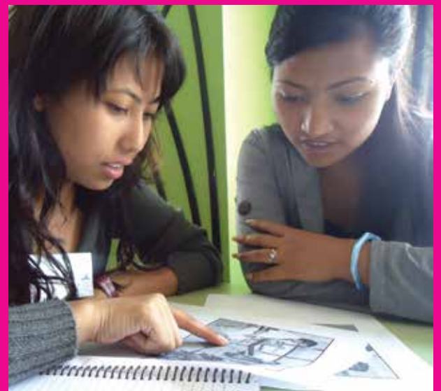
cover: Ipas Nepal youth consultant (at center) with women workers