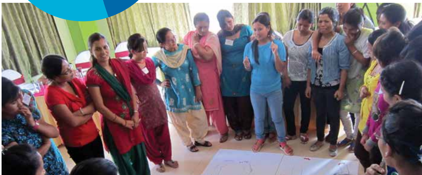
Youth facilitator leads body mapping activity

Ipas works with youth to enhance the ability of girls and young women to prevent unwanted pregnancy and obtain safe abortions—and to fulfill their sexual and reproductive rights, including their right to accurate health information and care.