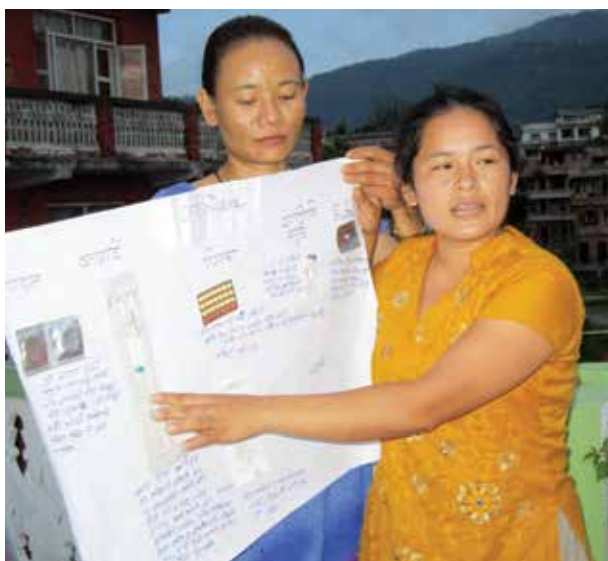
Women workers present their contraceptives poster

The meeting’s interactive agenda featured a “gallery walk” of photos and information about the project and a panel discussion during which SRHR facilitators, peer educators and factory managers shared their experiences with the project. Two journalists in attendance then reported on the project’s success in their respective newspapers, both with national readership. Meeting attendees expressed wishes for the project to continue, and some showed interest in collaborating with Ipas to replicate it in other settings.